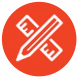
Tailor-made System and Panel Designs